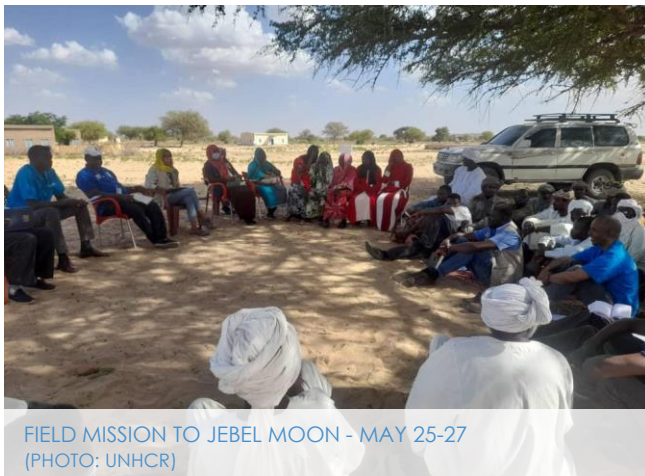
FIELD MISSION TO JEBEL MOON - MAY 25-27

As with all peacebuilding programmes in 2020, the PBF Darfur Programme was significantly affected by restrictions imposed due to the global COVID-19 pandemic, which limited the movement of staff and restricted access to key project sites. As a result, project implementation was largely halted for approximately six months. Despite these challenges, the programme was able to significantly scale up implementation towards the end of 2020 as restrictions were reduced, and by early 2021 was fully implementing activities under all three outcomes.