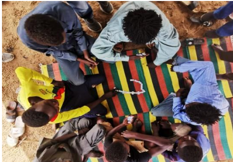
FIELD MISSION TO GEREIDA LOCALITY- JUNE 27-29

Access to land remains a key driver of conflict in Darfur. Millions of Darfuris were forcibly displaced from their homes during decades of armed conflict, with an estimated 2.5 million internally displaced persons (IDPs) in Sudan and 800,000 refugees in neighboring countries as of 2021. According to IOM, 85% of Sudanese IDPs are in Darfur, 57% of whom are in a situation of protracted displacement. Among these, 70% wish to remain in their current location, while 30% wish to return to their area of origin.