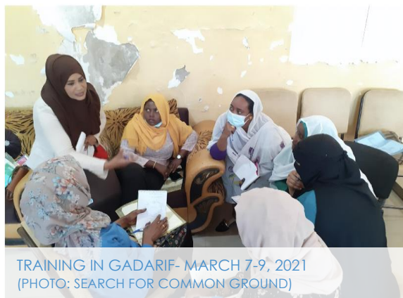
TRAINING IN GADARIF- MARCH 7-9, 2021

While the project has only been under implementation since early 2021, it has been able to implement several initial activities, including a Common Ground Approach (CGA) training for women political leaders in Gadarif State, involving the participation of 29 women political leaders, as well as for government representatives in Gadarif State, involving a total of 28 participants.