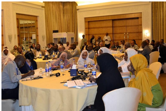
The validation workshop for TVET Policies Review in Sudan; Khartoum, August 2015

3. Improving the quality and enhancing the relevance and efficiency of existing TVET programs, staff and facilities. Much needs to be done in this crucial area, not only from the government side, but also by all stakeholders. Building national and institutional capacities to facilitate achieving the change towards quality and relevance is crucial. Priority areas of action include building partnerships with economic sectors through appropriate sustainable mechanisms such as sectoral