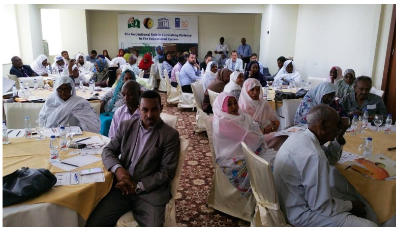
The workshop on Combating Gender-Based Violence in Sudanese education system; Khartoum, November 2016.

workshop “Institutional role in combating gender-based violence (GBV) in the educational system” of Sudan, which took place in Corinthia Hotel, Khartoum. 25 The workshop was organized within frameworks of the annual campaign “16 Days of Activism against Gender-Based Violence” (25 October – 10 December), which in 2016 has an overarching theme “From Peace in the Home to Peace in the