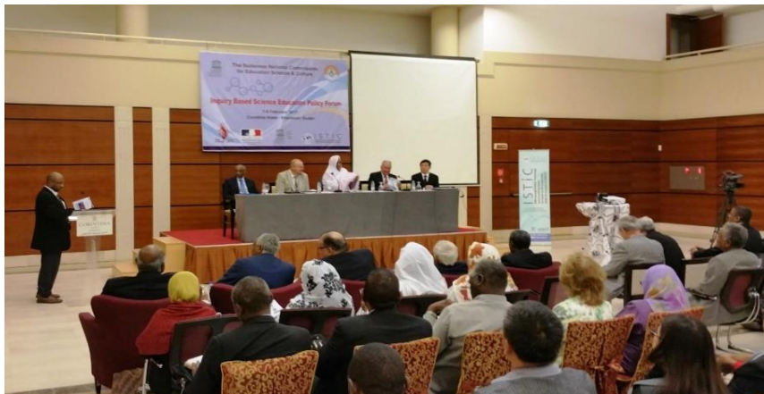
The Forum of IAP/SEP in Khartoum; February 2017: Promoting Inquiry based Science Education in Sudan.