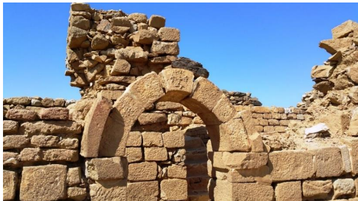
The remains of Christian monastery Al Ghazali (the Kingdom of Makuria) in the vicinities of Marawi. the Northern State of Sudan.

Unfortunately, Google Maps did not accept submissions for locating the following sites: