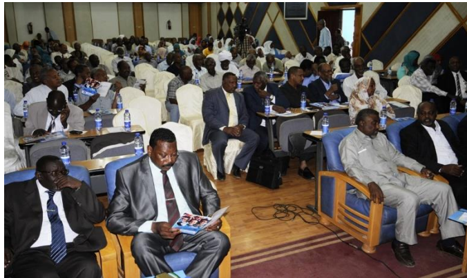
The World Water Day in Khartoum; March 2016.