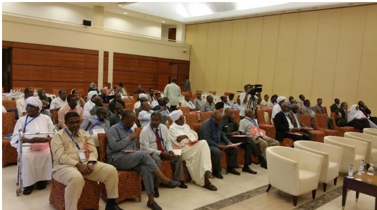
The Workshop on Water Harvesting; Khartoum, November 2016

1. On 19-20 November 2016, the Khartoum office of UNESCO together with the RCWH organized the workshop "Assessment of Needs and Priorities in Research and Capacity Building for Water Harvesting", which took place in Khartoum. 14 The workshop gave a floor for discussions about the subject to a wide range of practitioners and researchers from the water industry, different ministries and Academy from across the Sudan – about 60 persons in total. The representatives of local communities, where water harvesting is of great significance, also participated in these discussions.