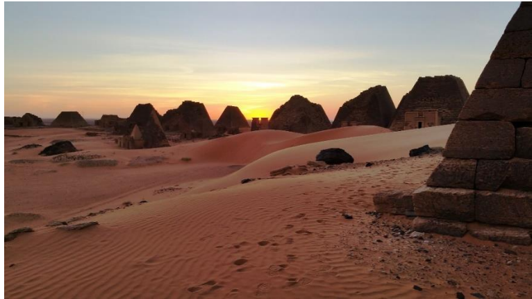
Meroe Island: the King cemetery. A green ray on sunset.

In accordance with the decision of the member-states of UNESCO, the World Heritage Center (WHC) was entrusted to maintain the list of natural and historical sites of outstanding value for all Humanity – the so-called World Heritage. Additionally to the general universal list, where currently Sudan has three inscriptions, two cultural / historical sites