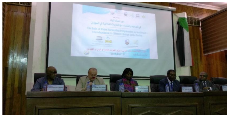
The workshop on the Role of Water Harvesting Programs in Resilience and Adaptation to Climate Change in Sudan; the Khartoum University, April 2017.

3. On 11 April 2017, the Khartoum office of UNESCO, and RCWH in collaboration with the Institute of Environmental Studies of the Khartoum University and NATCOM organized a workshop on the Role of Water Harvesting Programmes in Resilience and Adaptation to Climate Change in Sudan, 16 that took place in the University of Khartoum with participation from key stakeholders in the Water and Environment Sectors in Sudan – about 40 participants in total.