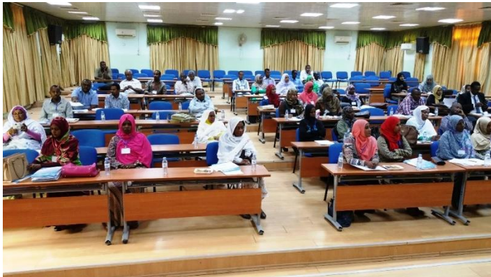
The Water Quality Training in Khartoum; March 2017.

Then, a 3-day Water Quality Training 19 was organized in Khartoum on 19-22 March 2017 by the