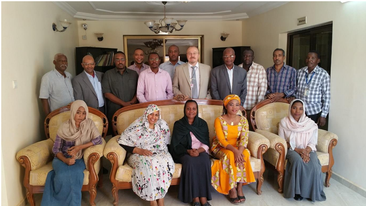
UNESCO Khartoum office’s team wills to make more – contributing to sustainable development and better quality of livelihood of all people of Sudan.