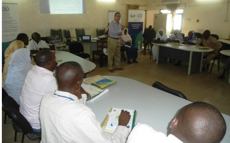
The ToT on Inclusive Education for Nyala, South Darfur education professionals; Khartoum, November 2015.

beginning of 2016 the deployment of this knowledge covering about 300 teachers in the Kassala and South Darfur states, which has potential to influence 2100 children with special needs per any following year.