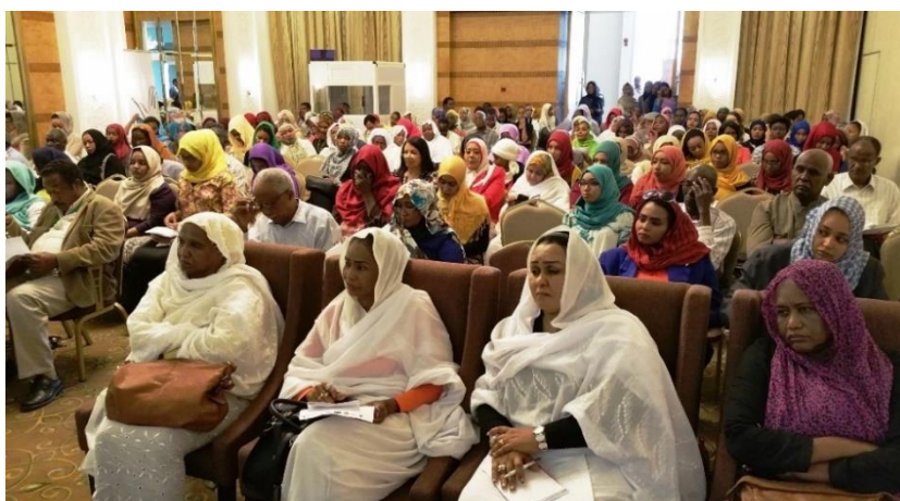
The debates on Empowering Women in Sudanese Media: Khartoum. May 2016.