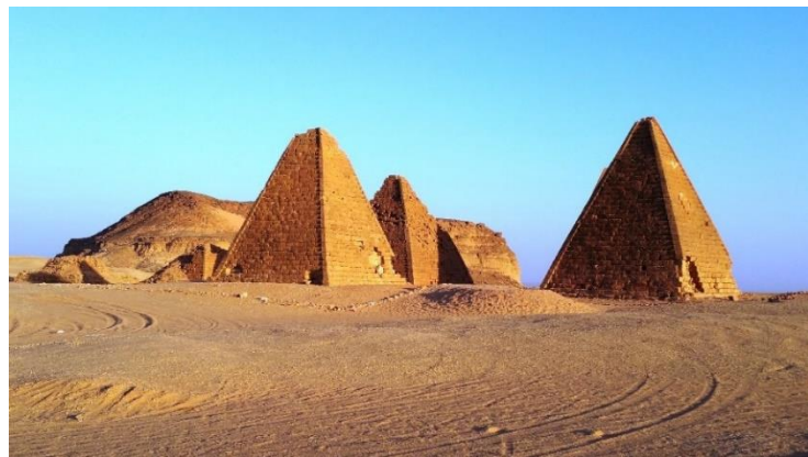
Jebel Barkal. A view on the rock through pyramids. (A very popular photo on Google Map – about 220 thousand views during first 9 months of 2017)

every country supports a list of sites-candidates to the WHC's universal list – so-called country's tentative list. This tentative list have to be reviewed by the country at least one time per decade. The revision of 2004 in Sudan resulted in six sites of its tentative list: