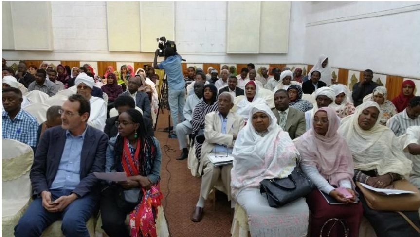
The World Radio Day in the Khartoum / Omdurman / Bahri metropolis; the Al-Azhari Radio Studio of the Sudanese National TV and Radio Corporation, Omdurman, February 2017.