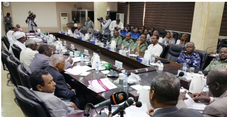
The workshop on promoting the 1970 Convention in Sudan; the Main Meeting Room in the Customs Police Headquarters, Khartoum, October 2017.

Then, the Sudanese NATCOM established a national 1970 Convention committee – to coordinate the promotion of the Convention, and ensure the continuity of efforts.