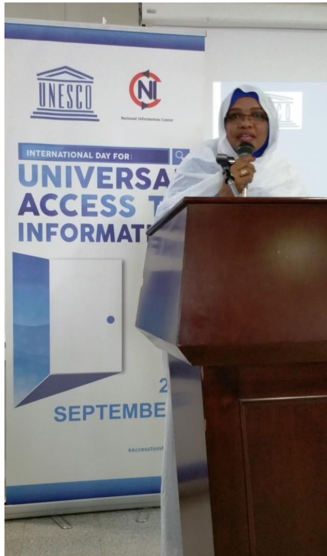
The Sudanese Minister of Communication and Information Technologies commits her support for the International Day of Universal Access to Information; Telecommunication Tower, Khartoum, September 2017.

The above described celebrations have contributed to the strengthening of the network of media professionals and academics linked to UNESCO circle, thereby supporting advocacy and capacity building around the issues of Freedom of Expression, Journalist Safety, Public Access to Information, etc. In 2016, the Sudanese media sector commemorated, for the first time ever, the World Press Freedom Day and International Day for Universal Access to Information.