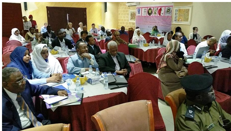
The workshop on Ending Violence against Women and Girls; Khartoum, March 2016.

1. On 8 March 2016, in a context of the International Women's Day, a workshop "Making the Awareness of Rule of Law and Human Rights work for Women" took place in Khartoum. 24 The