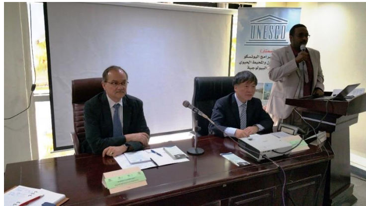
Mission on MAB and IDGP in Sudan, March, 2017