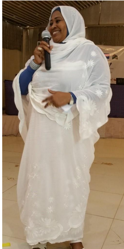
The Sudanese Minister of Education evaluates the status of SDG 4 implementation in the country; Khartoum, August 2017.

The project started in August 2016, and the validation workshop took place in August 2017. Main outputs of the project are (1) the Sudanese Country Background Report, prepared by the national team of the project in October 2016, and validated by MoE in April 2017, and (2) the Sudan Policy Review Report validated in August 2017.