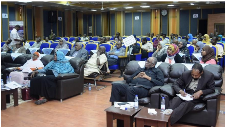
The workshop on promoting the UNESCO's International Geosciences and Geoparks Programme (IGGP) in Sudan; May 2017.

On 25 May 2017, the UNESCO Khartoum Office in partnership with the Sudanese NATCOM and Geological Research Authority of Sudan (GRAS) organized a workshop for promoting UNESCO's