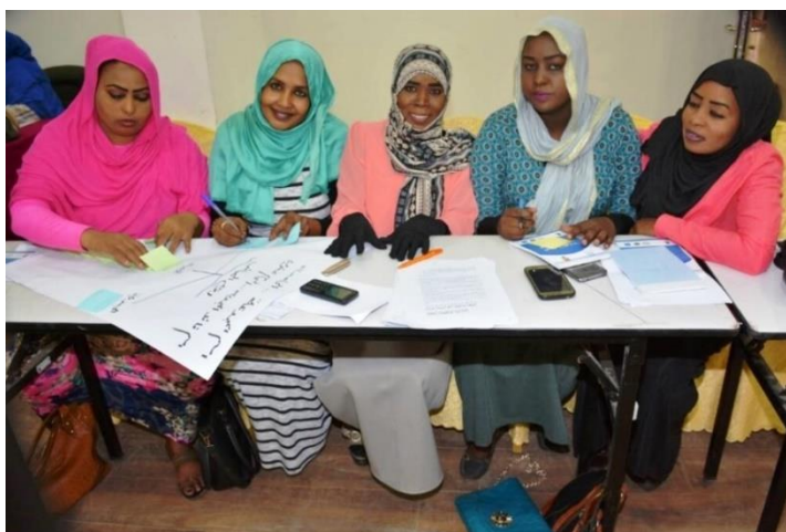
The safety training for women-journalists in Nyala, South Darfur, August 2017.

Finally, the SJU organized 3-day training sessions in several states, these included: