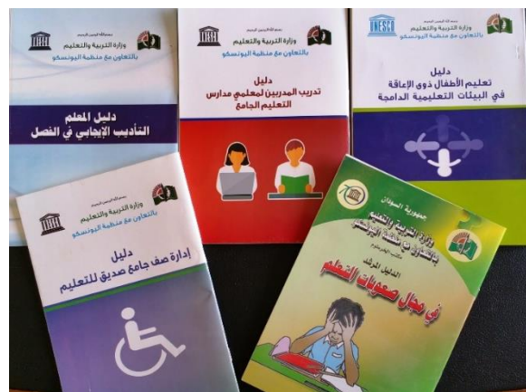
The developed ToT materials and Teacher's guides for inclusive education tailored to the Sudanese context.

In November 2015, the UNESCO Khartoum office organized three ToT for the relevant education