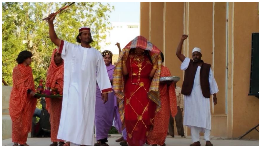
The traditional Sudanese wedding ceremony – possible item for the Sudanese Intangible Heritage list.

The project was prepared by the Sudanese NATCOM and MoC, and approved by the Intangible Cultural Heritage Fund (ICHF). The project with the budget 174 K USD aims to conduct a pilot inventory of the ICH of Kordofan and Blue Nile states launching a Sudanese ICH inventory. Before 2017, no such inventory exists, although there is a lot of relevant information resulting