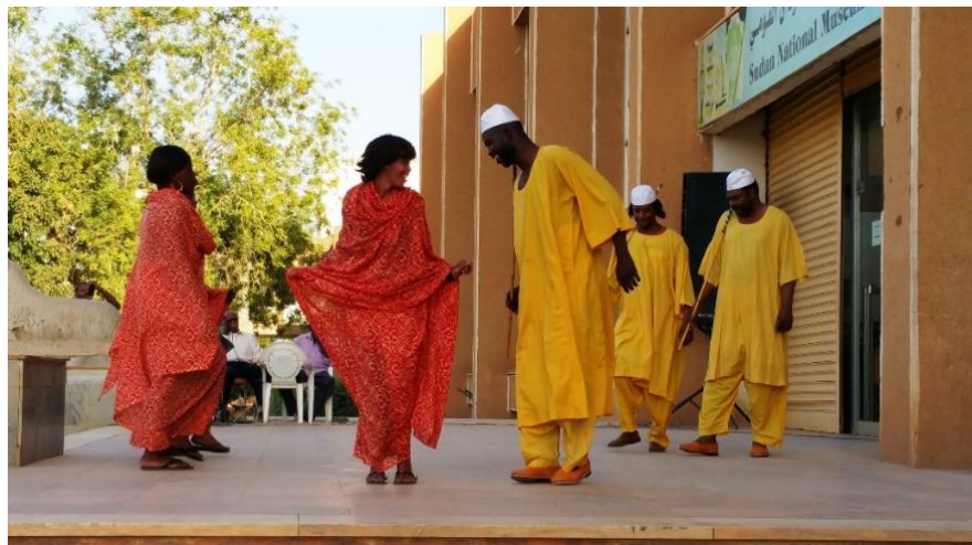
The folk dance of one of the Sudanese ethnic group.

The 2005 Convention – “Protection and Promotion of the Diversity of Cultural Expression” – was fully adopted by Sudan in 2008. The responsible national body for the Convention is the Ministry of Culture (MoC), and there is a big room in strengthening the capacities of the MoC to manage the