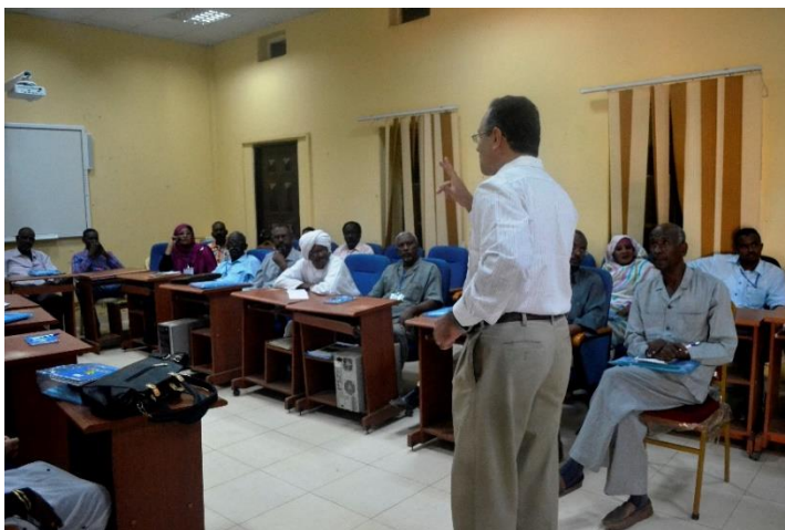
The ToT on Inclusive Education for Kassala's education professionals; Khartoum, November 2015.

In November 2015, the UNESCO Khartoum office organized three ToT for the relevant education