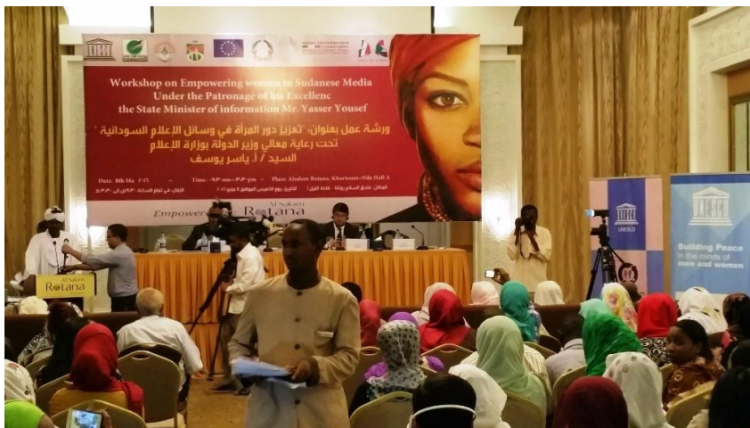
The debates on Empowering Women in Sudanese Media; Khartoum, May 2016.

The UNESCO Khartoum Office in cooperation with the NATCOM and other national and international partners were successful in organizing a number of activities under the banner “Empowering women in Sudanese media”. These activities have served to consolidate UNESCO’s role as a leader in Sudan’s Media Development.