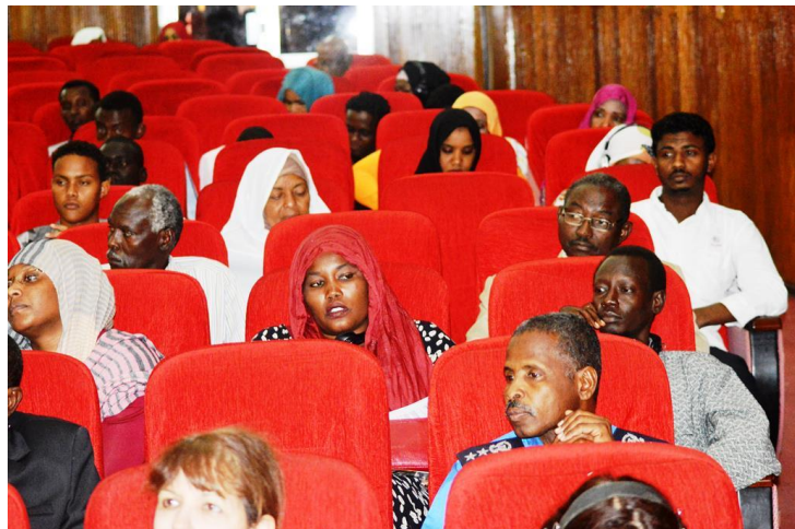
The Conference “Safeguarding Cultural Heritage: Challenges and Opportunities in the Sudanese context”, the Khartoum University, November 2015.