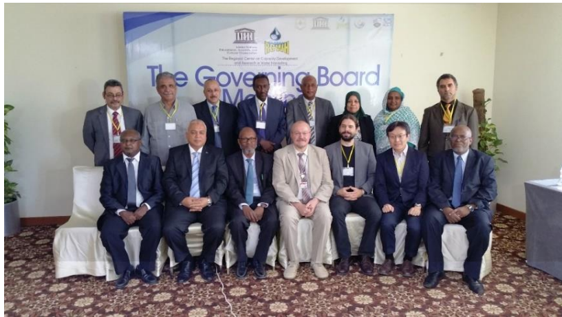
The meeting of the Governing Board of the RCWH; Khartoum, December 2016.