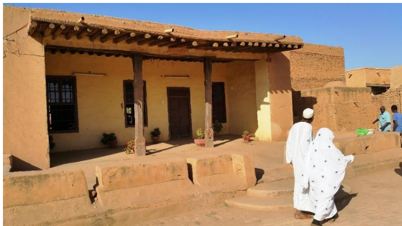
Khalifa's House in Omdurman: a museum of Mahdi's period of Sudanese history. (Khalifa was a ruler during Sudanese independence in 1885-97 – after the Mahdi's rebellion. On the photo – his primary permanent residence)

In November 2016, the Swiss Embassy in Khartoum entrusted to the Sudanese National Corporation for Antiquities and Museums (NCAM) the production of the booklet shortly describing the Sudanese Heritage in English and Arabic. The booklet has to cover all twenty officially recognized sites: three from general WHC list, and seventeen from the revised tentative list – see both lists above.