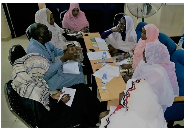
The 2 nd workshop for producing a Teacher Guide for the evaluation of deaf students in general education; Khartoum,

The workshop was organized in October 2015 jointly with the MoHE, Department of Student’s Affaires – resulting in recommendations focused on facilitating existing infrastructure of ICT for disabled students. As a follow up, the MoHE adopted a project to provide a MP3 recorder/player for every blind student in higher education institutions.