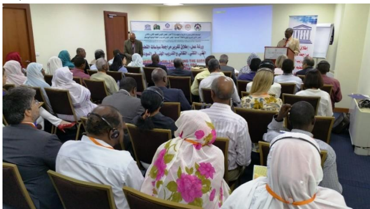
The scoping workshop for the Cap-ED's project in Sudan in strengthening its TVET system; Khartoum, May 2016.

6. Securing sustainable resources. With increased value being placed on TVET as an important factor for improving employability, financing policies need to ensure both the stability of funding for developing the capacity for policy implementation, and a level of financing that will make it possible improve TVET outcomes. The measures that should be considered by the GoS range from increasing