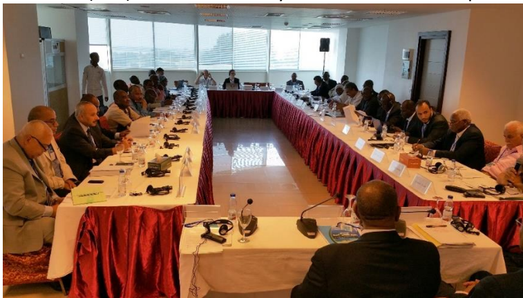
The validation meeting for Nubian Sandstone Aquifer Project; Khartoum, September 2017.

The preparation of the Project on Nubian Sandstone Aquifer in frameworks of Global Environment Facilities (GEF) was launched by UNDP. On current phase of the Project preparing, all major stakeholders started to be involved