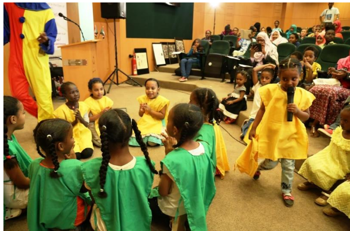
The 3-day children's workshop "Sudanese Cultural Heritage in the Eyes of Children and Youth: Traditional Folk Tales", Khartoum, February 2016.

The first two days took place in the Sudanese National Museum and the third and last day was held in the Auditorium of the Al Faisal Cultural Center. The workshop aimed to develop new means of raising awareness among the younger generation about traditional Sudanese tales – taking as an example the texts of "Al-Ahaji" with appropriate illustrations, and making children #United4Heritage .