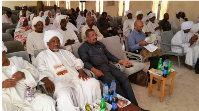
The ToT in frameworks of the Sudanese National Literacy Campaign; Shendi, the River Nile state, April 2016.

In 2016-17, the UNESCO Khartoum office and NCLAE contributed in organizing training sessions for trainers of teachers (ToT) of non-formal education – in the Gezira, River Nile and Northern states of Sudan. About 60 trainers for teachers were trained. Counting that every trainer refreshed knowledge and skills of 40-60 teachers of literacy classrooms, this initiative results in better learning of approximately 12 thousand children and youth in rural regions of Sudan per year.