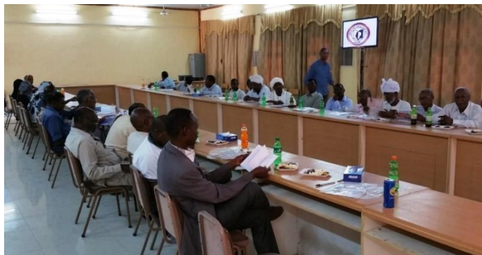
The discussion of ideas of GCED and views on them from the Sudanese context – integrating to Sudanese curricula; National Institute of Education / NCCER; Bakht Al Ruda, the White Nile state, April 2017.

Contributing to these all-UNESCO's efforts, in April 2017, the UNESCO Khartoum office together with the UNESCO Beirut office, Ministry of Education (MoE), National Centre for Curriculum and Education Research (NCCER), UNESCO National Commission (NATCOM) and the National Council for Literacy and Adult Education (NCLAE), have conducted orientation workshop on Global Citizenship Education (GCED) at the National Institute of Education