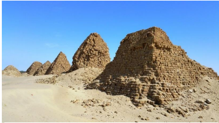
Jebel Barkal: the Nuri pyramids

In the beginning of 2017, the UNESCO Khartoum office did an effort to reflect the Sudanese Heritage sites in Google Maps application – making tourism around them easier. Accordingly, with focus on Cultural Heritage Sites, the application contained information about (first – name from Google Maps):