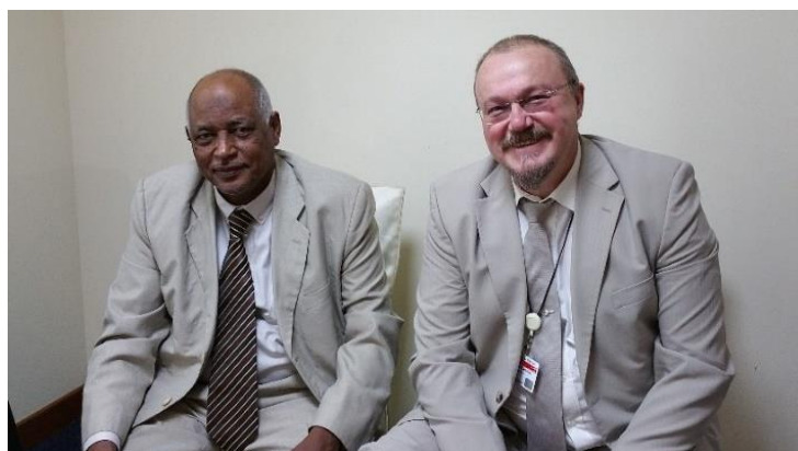
The UNESCO NATCOM and Khartoum office: quality of cooperation passes the time-test

UNESCO Khartoum office which is a subsidiary of UNESCO Headquarters in Paris helping it, NATCOM, members of UNESCO family, and other partners to implement the social development projects in UNESCO’s area of specialization.