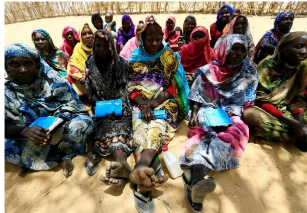
Women in Umm Al - Khairat village in Yassin locality, East Darfur