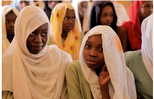
PBF visit to Umm Al - Khairat village in Yassin locality, East Darfur, March 2022

The below summaries aim to capture the key inputs and common trends identified during the group discussions: